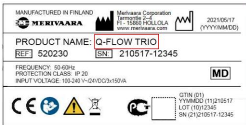
Figure 1. Example of the device's type plate

This Field Safety Notice concerns the above listed Merivaara Q-Flow lights manufactured before June 2023 . The manufacturer and model of the surgical light can be checked from the type plate attached to the device, see Figure below.